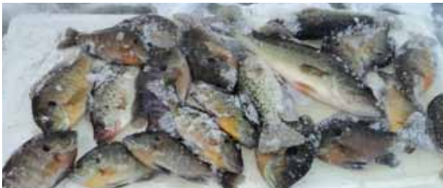
MEAT & FISH